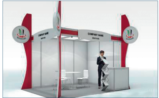
Illustration: Corner booth

Please note: Above prices are excluding VAT which will be applied on invoice as applicable.