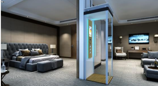
We are also excited to introduce our latest product, the EMAK MINI (Throughfloor Lift), at stand No: 2012 in Za'abeel Hall 6.