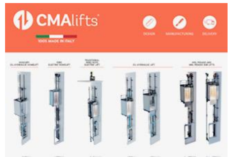
We are waiting for you at Stand 2019 Za'abeel Hall 6