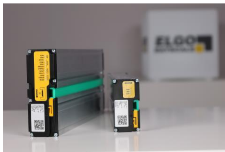
We are waiting for you at Stand 2039 Za'abeel Hall 6