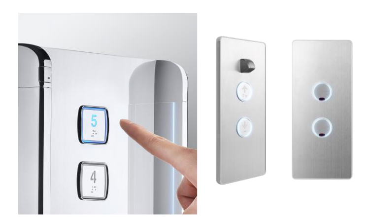
We are waiting for you at Stand 2010 Za'abeel Hall 6

Airtact provides a touchless alternative to conventional elevator buttons, minimizing the risk of cross-contamination and ensuring a heightened level of hygiene for building occupants. With its sleek and modern design, Airtact integrates into any elevator system, making it an ideal choice for both new installations and retrofitting existing ones.