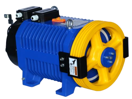
We are waiting for you at Stand 1020 Za'abeel Hall 6