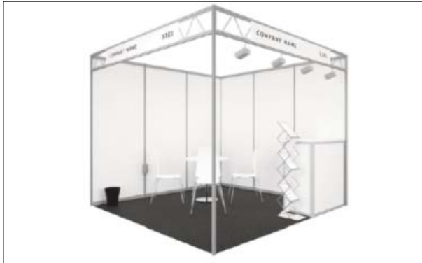
Illustration: Corner booth