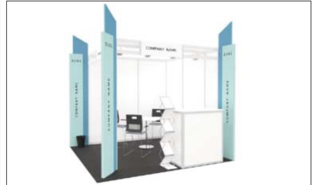
Illustration: Corner booth

An order confirmation with all details will be sent to you after placing the order.